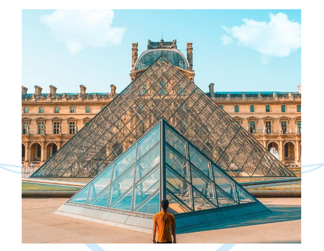
Louvre Museum, Paris

Total time: 6-10 hrs Louvre Museum - Around 2-3 hrs Jardin des Tuileries - Around 1- 2 hrs Musée d'Orsay - Around 2-3 hrs Place de la Concorde- Around 1- 2 hrs