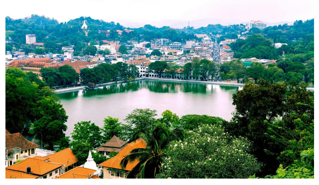
Temple of the Tooth Relic and Lake Kandy, Sri Lanka