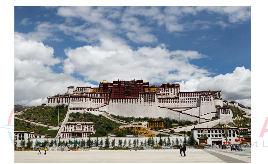
Potala Palace, Lhasa

Our Lhasa Tour of 3 Nights/ 4 Days taps into the cultural and spiritual essence of these famous monuments like the Potala Palace, a magnificent former home of the Dalai Lamas, Jokhang Temple, Tibet's most sacred shrine, Barkhor Street, a bustling pilgrimage route.