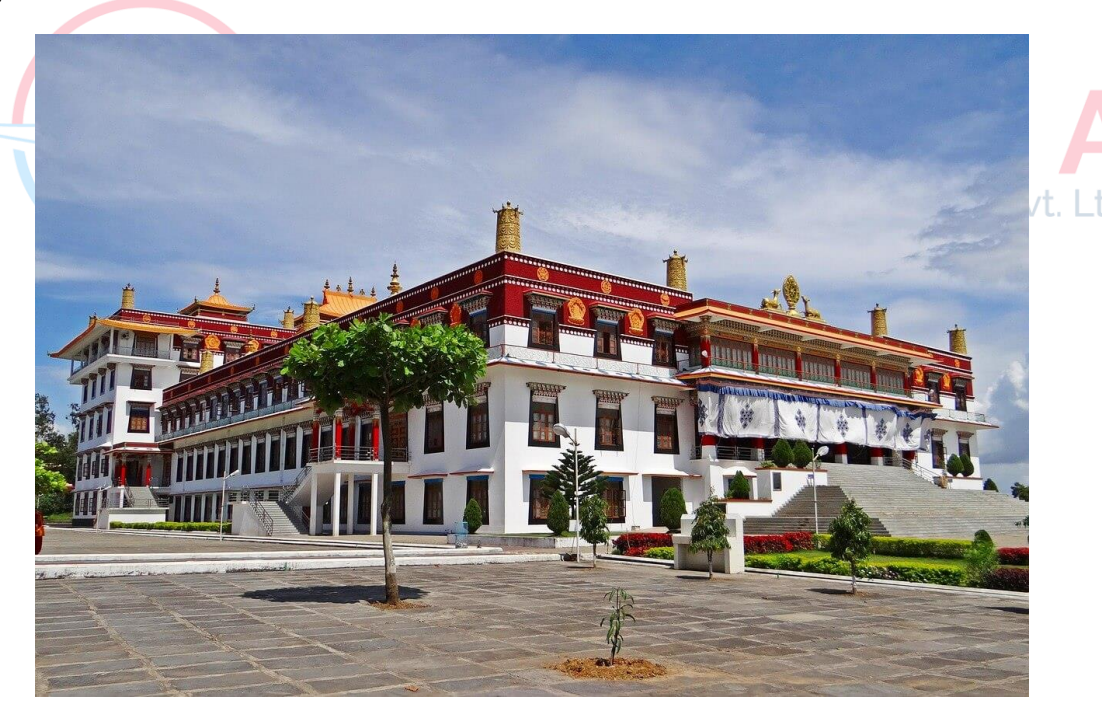
Drepung Monastery, Lhasa

After breakfast, via coach, start in Drepung Monastery , which was formerly home to more than 10,000 monks and was a significant hub for Buddhist education. It is also known as the "Mother School of the Dalai Lamas" and has sweeping city views.