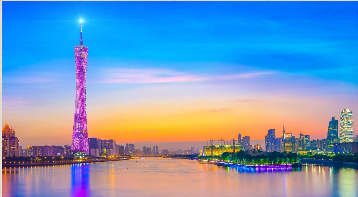
Canton Tower, Shanghai

After breakfast, we escort you to Shanghai Pudong International Airport (PVG) to fly to Guangzhou. You can stroll around these monuments or go into full exploration of the breathtaking views from Guangzhou's Canton Tower , discover the Chen Clan Ancestral Hall's traditional elegance, and unwind at Yuexiu Park , which is home to the well-known Five Rams Sculpture. Visit the Guangzhou Museum and the Sun Yat-sen Memorial Hall to see the imperial China.