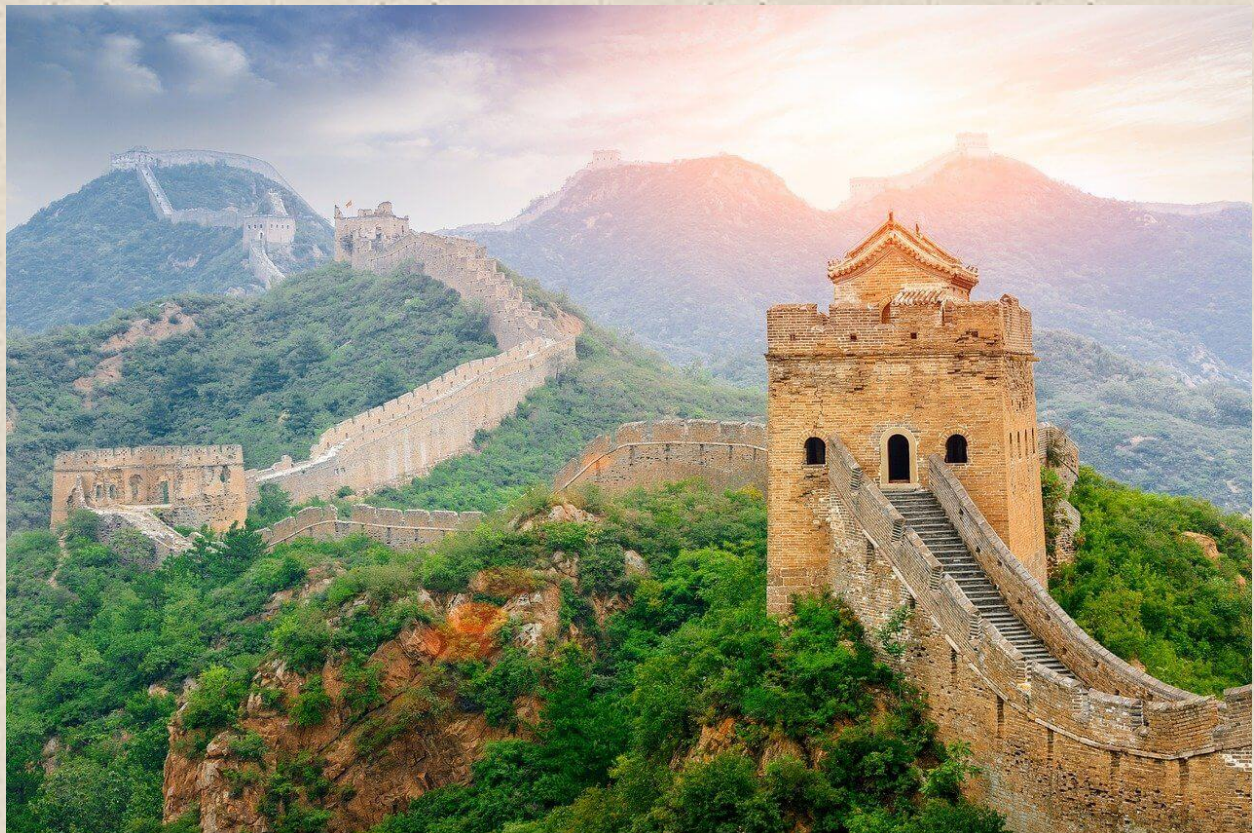
Great Wall of China

Discover the core of China, where modern marvels coexist with old heritage. Visit the famous Great Wall at Juyong Pass, stroll through the Forbidden City, and learn about the ancient Tian'anmen Square, the place where China was declared as the Republic of China. Discover the rich history of this amazing country while unwinding at the serene Summer Palace, which is bordered by lovely gardens and Kunming Lake.