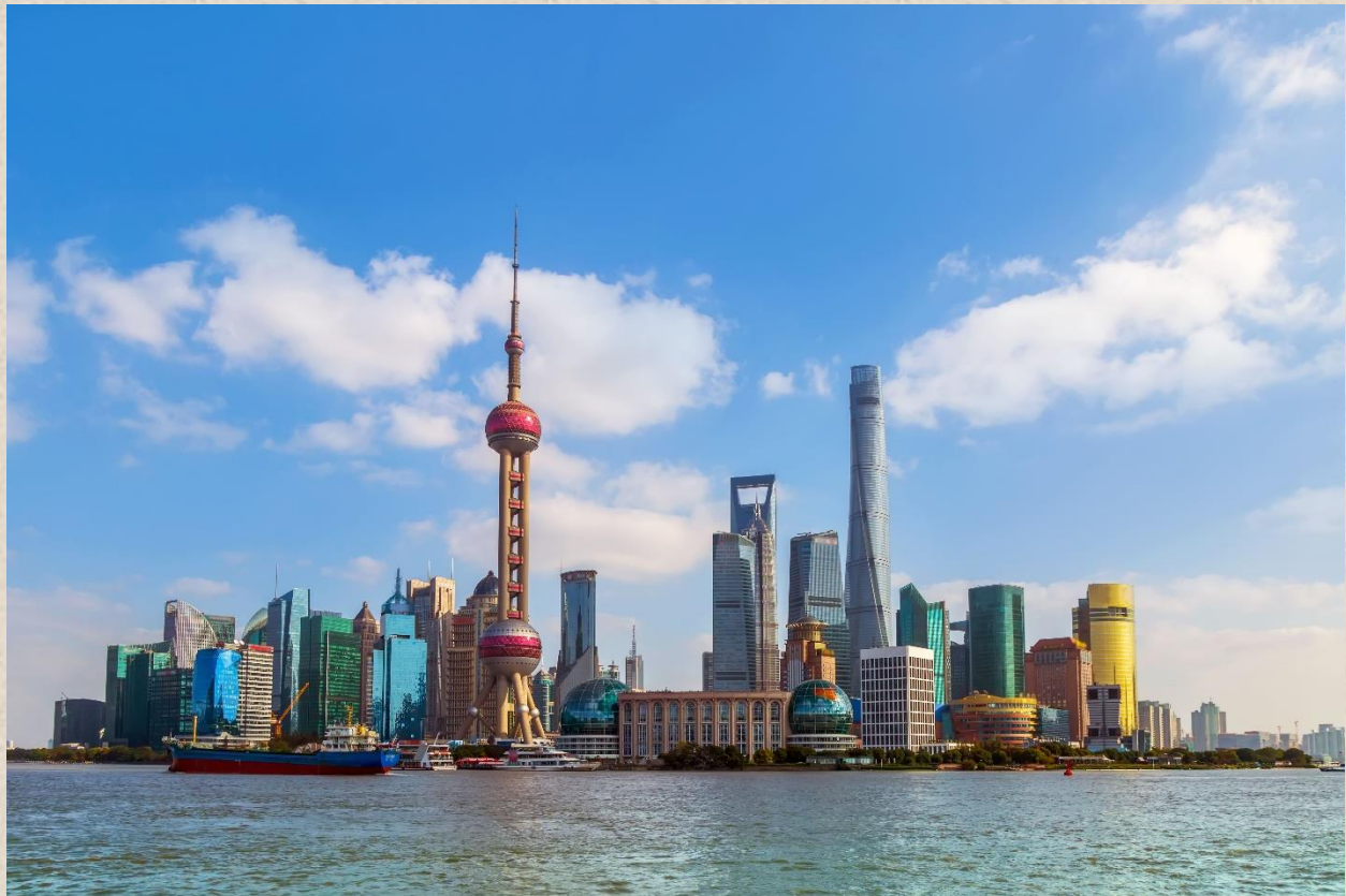
The Bund, Shanghai

After breakfast, we head to the serene Yu Garden where you can see the classical Chinese architecture of beautiful pavilions, ponds and its walkway. Also, explore the Jade Buddha Temple where two large Buddha statues are made of jade, golden Buddhas are kept at display at the Grand Hall as well as other Buddha deities. Then head to Shanghai's Bund where you'll see the striking blend of historic colonial buildings that mostly include banking services, and the modern architecture, featuring iconic landmarks like the Shanghai Tower and the Oriental Pearl Tower .