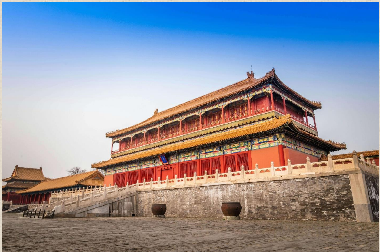
Forbidden City, Beijing

Full from breakfast, we head to Tian'anmen Square , that has great political significance, particularly as the site where China was declared the "People's Republic of China" in 1949. Explore the Tian'anmen Gate (Gate of Heavenly Peace), the Monument to the People's Heroes , the Mausoleum of Mao Zedong , the Great Hall of the People , and the National Museum of China .